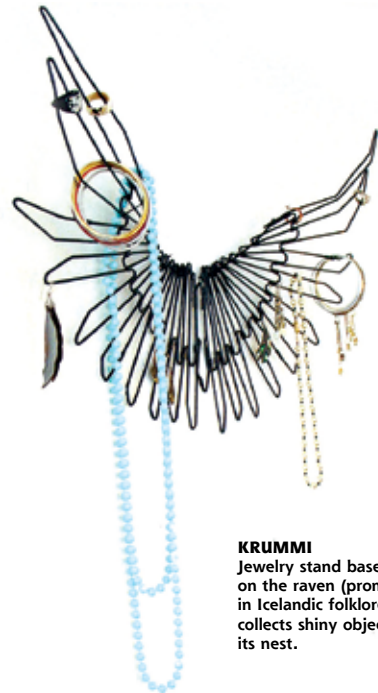
KRUMMI Jewelry stand based on the raven (prominent in Icelandic folklore), which collects shiny objects for its nest.