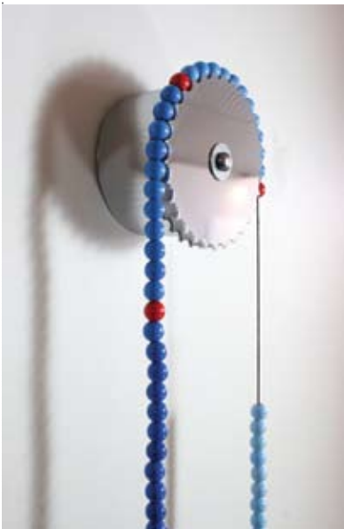
CLOCK One bead drops every five minutes, seeming to slow down time. Remove the beads from the cog to stop time and wear them proudly around your neck.