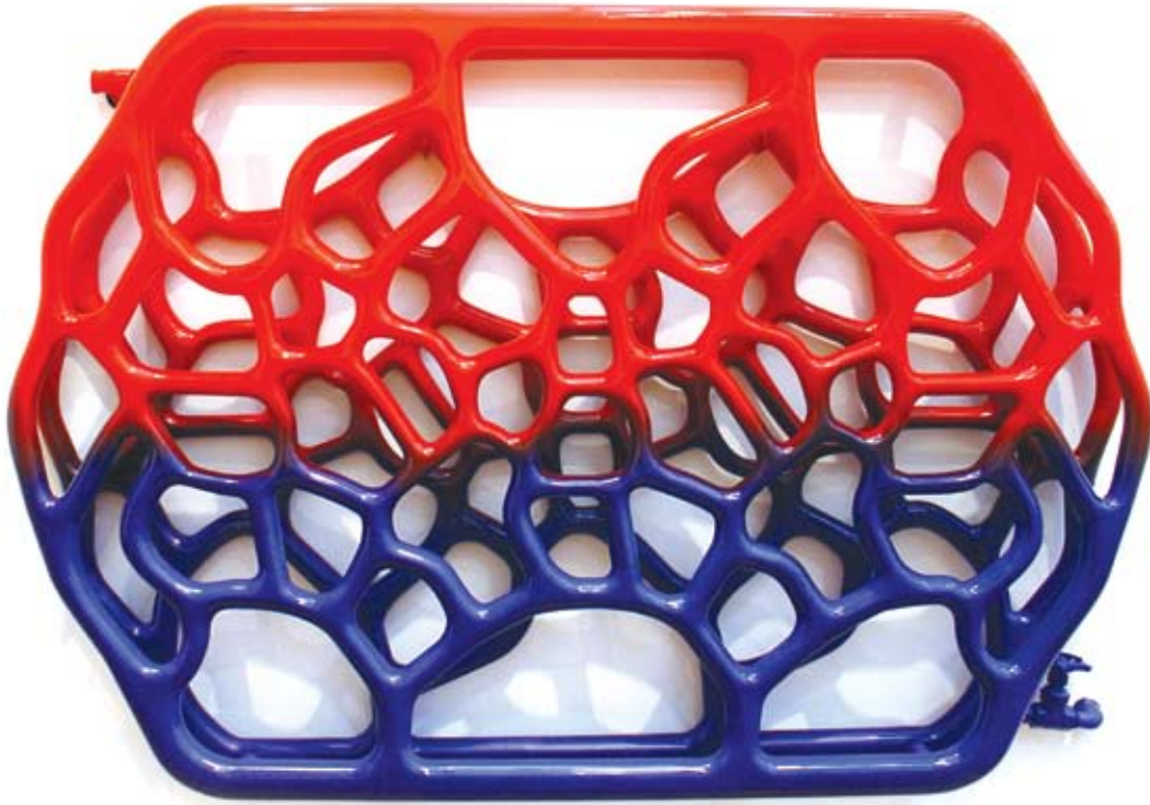
BLUSH Cast iron radiator with heat-sensitive coating. Blue when cold, turns red when over 30°C.

Three pieces from designer Þórunn Árnadóttir.